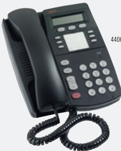
4406D Digital Telephone

Displays, advanced digital interfaces, and a range of programmable feature keys make the Avaya 4400 and 6400 Series telephones the ideal choice for high quality, efficient voice communications.