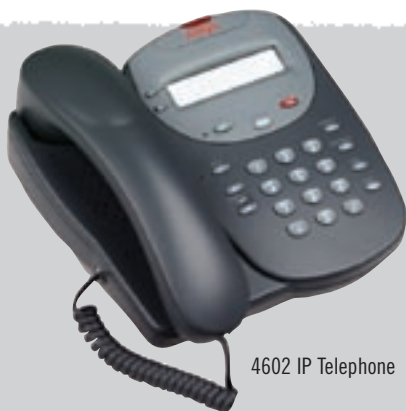
4602 IP Telephone