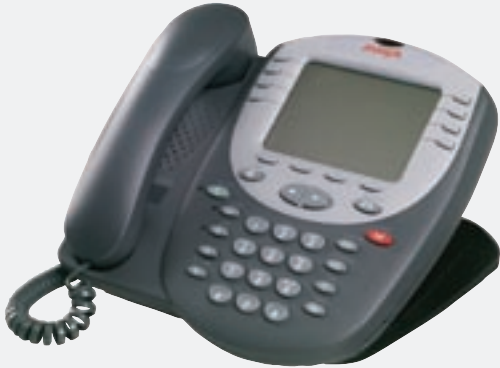
2420 Digital Telephone

Avaya IP Office supports IP- and non-IP telephones.