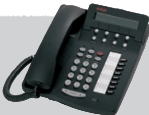
6408D Display Voice Terminal