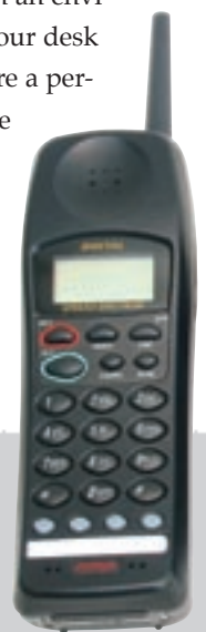
Avaya 3810 Wireless Telephone