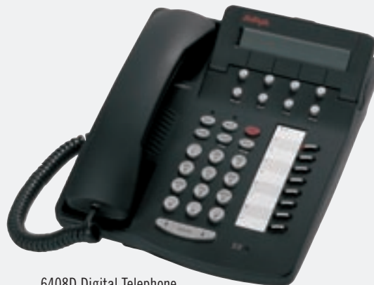
6408D Digital Telephone