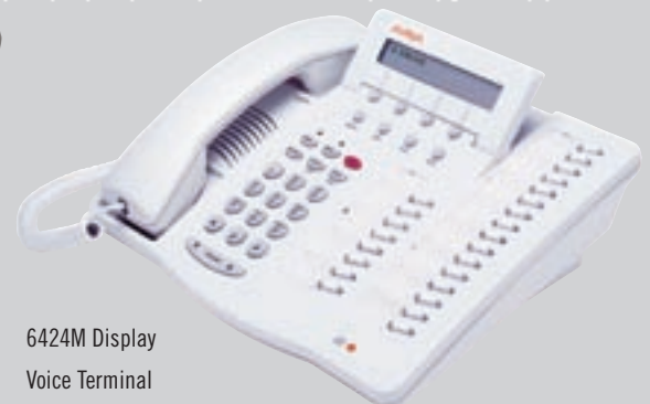
6424M Display Voice Terminal