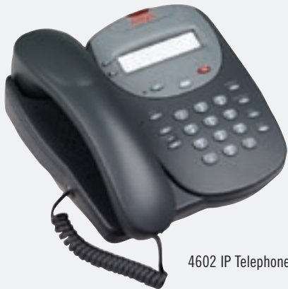
4602 IP Telephone

A large display, automatic key labeling, a 100-entry call log for tracking records on incoming and outgoing calls—the Avaya 2420 telephone delivers the advanced productivity-boosting features that put it in a class of its own.