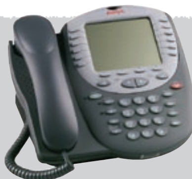
4620 IP Telephone