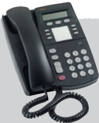
4406D 6-Button Digital Telephone

Make call handling easier by adding additional capacity to your telephones with an Avaya console. Ideal for attendants, operators and executives who require additional capacity, a console allows you to add additional direct station select keys to a desk phone. One DSS4450 Console adds 60 direct station select keys to the 4424 telephone (one 4424 telephone can support up to two DSS4450 Console), and the XM24 Console adds 24 additional keys to the 6416 and 6424 telephones. The EU24 Console, available November, 2004, will work with the 4620 and 2420 telephones. The 4620, 2420, 6416, and 6424 telephones can support only one expansion module per phone. They are easy to use and have a small footprint on any desk.